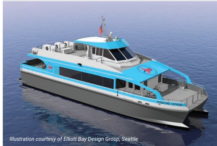
Illustration courtesy of Elliott Bay Design Group, Seattle

In the near future the N.C. Ferry System expects to add direct passenger-only service from Hatteras Island to Ocracoke Island’s Silver Lake Harbor, giving tourists an opportunity to explore the island without having to worry about traffic of parking .